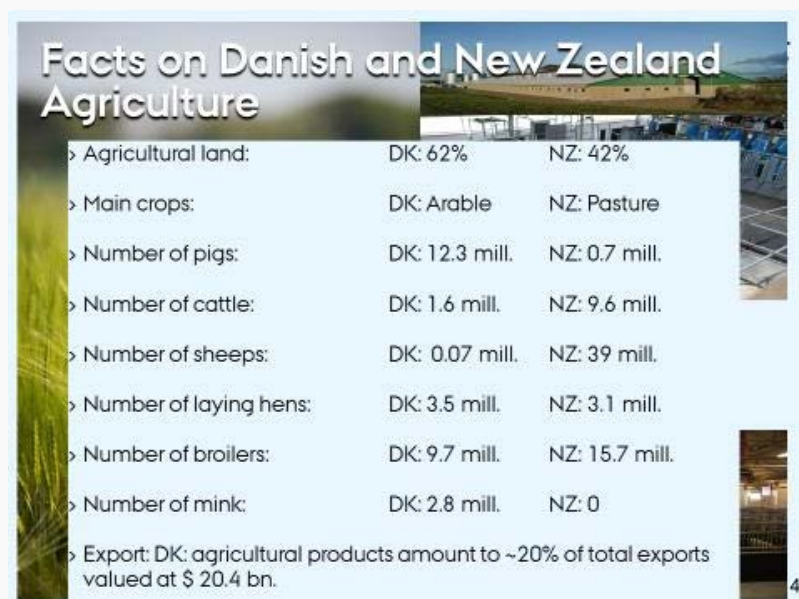
Table 1. Comparison between Danish and New Zealand agriculture

You can read the conference paper abstracts here